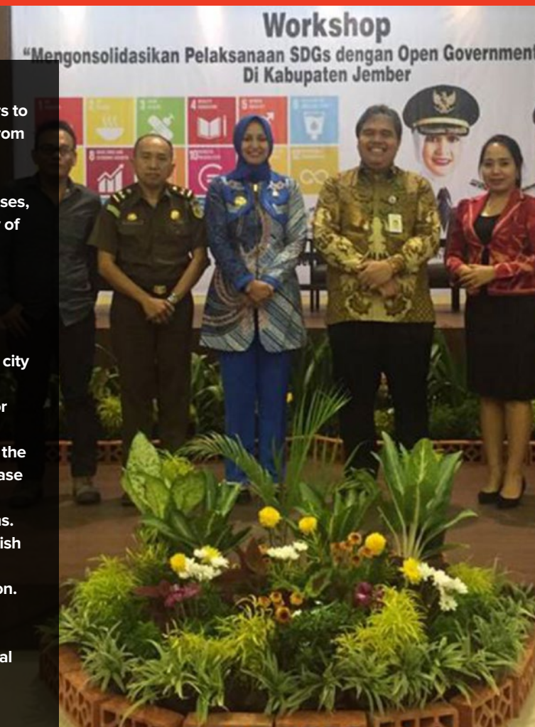
OPEN GOVERNMENT INDONESIA

Many Indonesians currently face barriers to justice — stemming from the limited national budget for legal assistance, an increase in the number of legal cases, low quality and limited availability of services from the Legal Aid Organization, and lack of legal knowledge in Indonesian communities. To address these challenges, the National Law Development Agency will expand city and provincial regulations that guarantee government support for legal aid, increase and improve current legal aid services through the Legal Aid Organization, and increase citizens' awareness of their legal rights through education programs. In addition, the Agency will establish a community legal center where people can obtain legal information. The government hopes these measures will improve the satisfaction levels reported by legal aid service recipients.