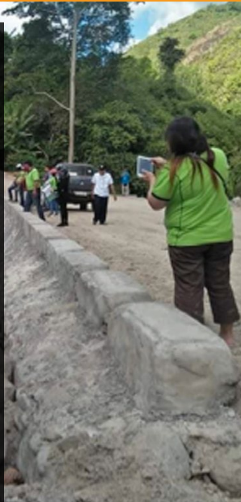
SOUTH COTABATO FACEBOOK PAGE

After consultations with contractors, the business sector, and civil society, South Cotabato aims to proactively disclose the status of infrastructure projects on a near real-time basis through the provincial government website and social media channels. These initiatives will create opportunities for citizens and civil society to provide feedback and post recommendations so that issues on project implementation delays, quality concerns, and poor use of public funds may be addressed. The online and offline mechanisms seek to bolster citizen engagement to hold concerned government officials and contractors accountable for delays in project delivery.